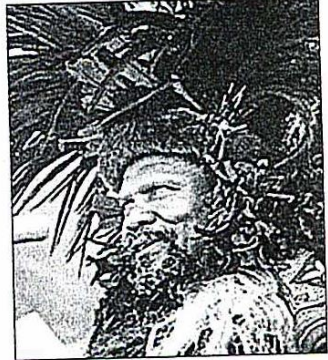
LEGEND: The late King Sobhuza II.